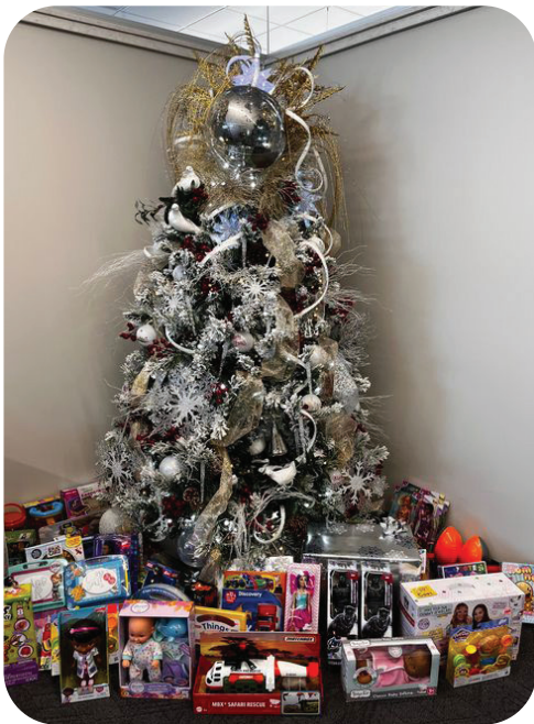
Joy Park Community Center Gift Give-Away